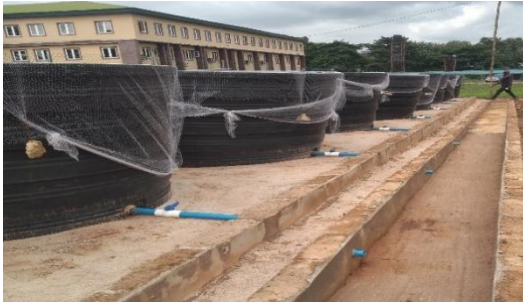
Figure 1. Plate 1: Plastic Tanks at the Grow Out Unit of the TETFund Centre of Excellence in Aquaculture and Food Technology situated in the University of Benin, Benin City, Nigeria.

commercial fish feeds from July to November 2024. No growth inducing hormone/treatment was administered to the fishes throughout the study.